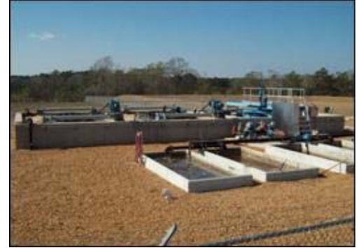
Shown above is a 250,000 GPD system

poured in place. With over thirty years of commercial treatment experience, industry leaders Hoot Systems and SOS are proud to now offer California the best performing , most cost-effective wastewater treatment solutions available on the market! Call SOS today at (877) 888-4668 or CLICK HERE for more information on our quality commercial treatment solutions!