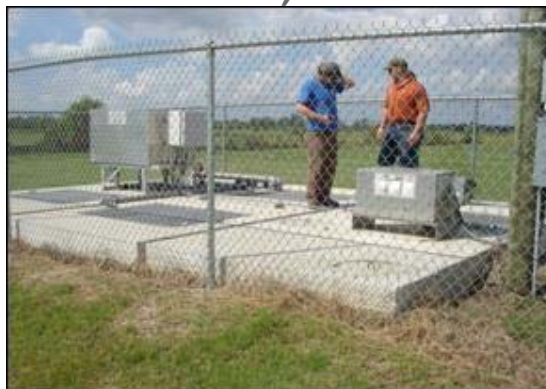
Hoot commercial treatment technology is successfully utilized in this 10,000 GPD system at an elementary school

Custom Performance-Based Commercial Solutions for Flows from 2,000 GPD to Multiples of 300,000 GPD